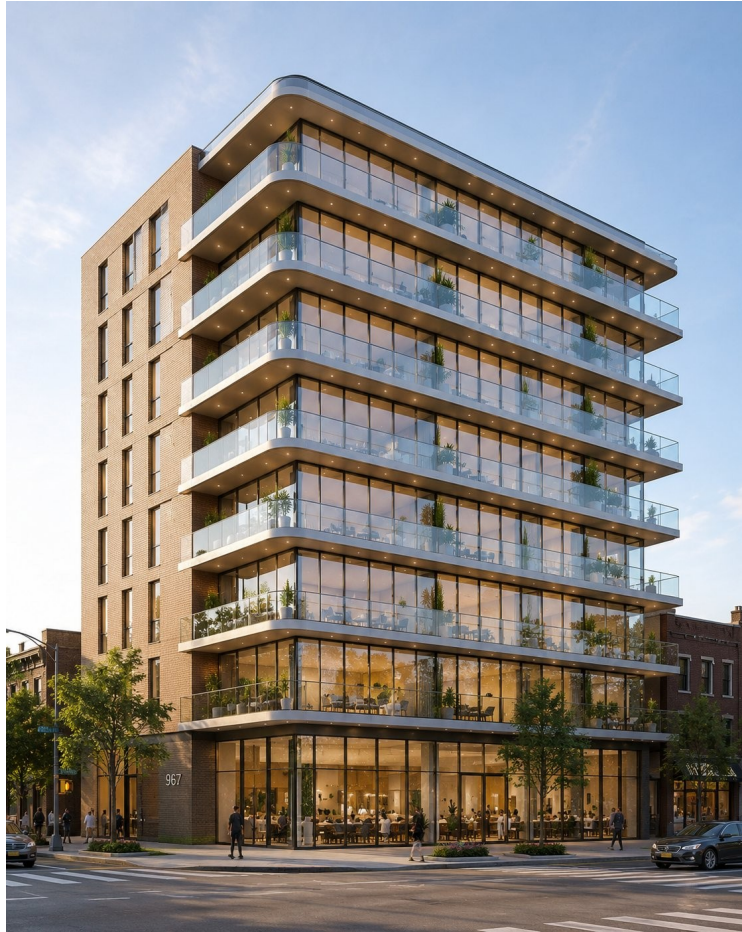
Architectural rendering — 967 Nostrand Avenue (illustrative)